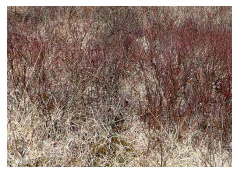
Photo: Birch saplings in the Loch Lomond and Trossachs National Park

During the walk Ruth Anderson, a member of the group showed Goto the robust bonsai-tree like stem of a native birch tree and its root structure. It supported new tree growth once sheep were removed (and deer fenced out) of that area of the new National Park. The removal of sheep from the Scottish landscape makes an enormous impact on trees and their ability to regenerate and prosper.